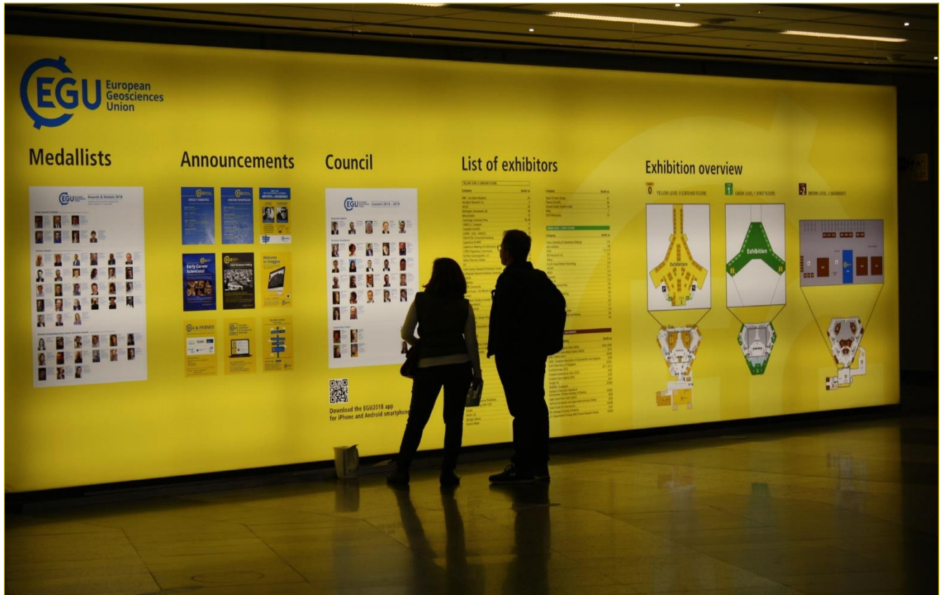
Inside the Austria Center Vienna during the EGU 2018 General Assembly