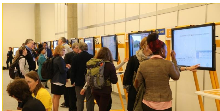
Researchers discuss PICO presentations.

Full guidelines for PICO (Presenting Interactive Content) presentations are available on the General Assembly website a few months before the meeting. PICO scientific sessions start with a series of 2-minute long presentations, one from each presenting author. They can feature traditional PowerPoint slides, a movie, an animation, or simply a PDF showing your research on a large screen. After the