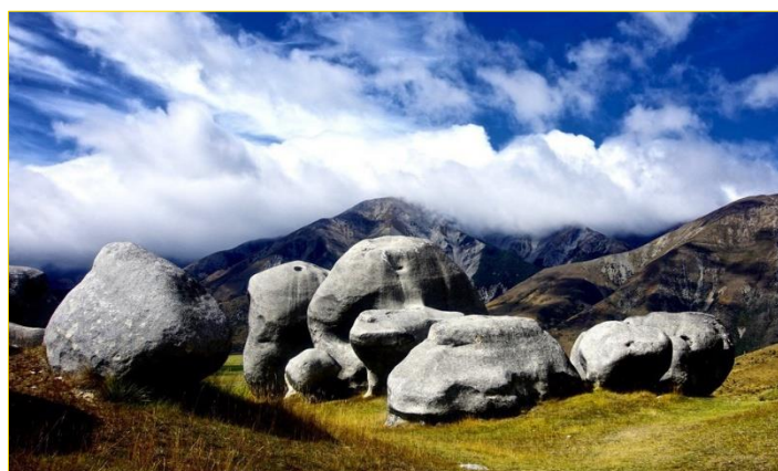
One of the EGU 2018 Photo Competition winning photos: 'Remains of a former ocean floor' by Jana Eichel, distributed via imageo.egu.eu .

Shortlisted photos are exhibited at the EGU General Assembly, where participants vote for their favourites. The winners are announced on the Friday of the General Assembly and receive a free registration for the following year's General Assembly. All finalists get one free book of their choice from the EGU library. Further information and previous winners can be viewed online at Imageo. The winning images are turned into postcards that are distributed at the next General Assembly.