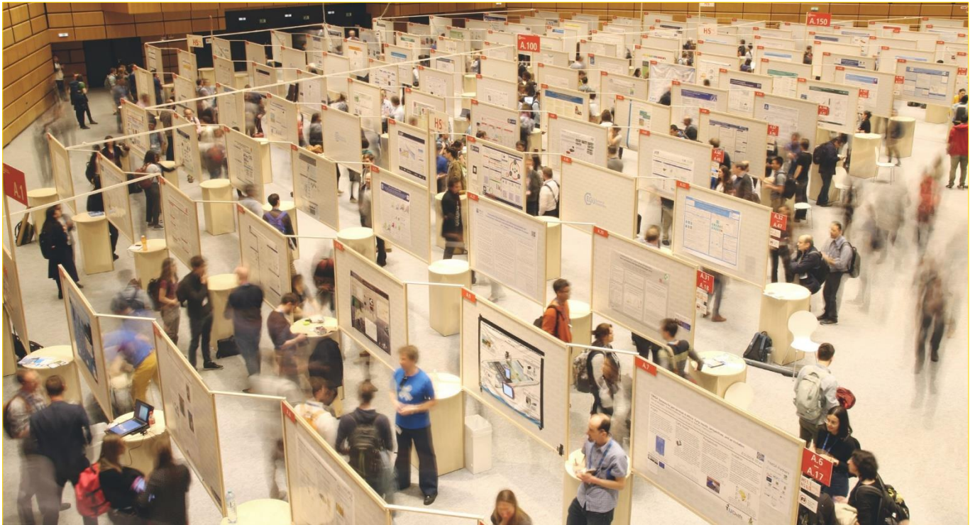
Poster Hall at the EGU 2018 General Assembly at the Austria Center Vienna